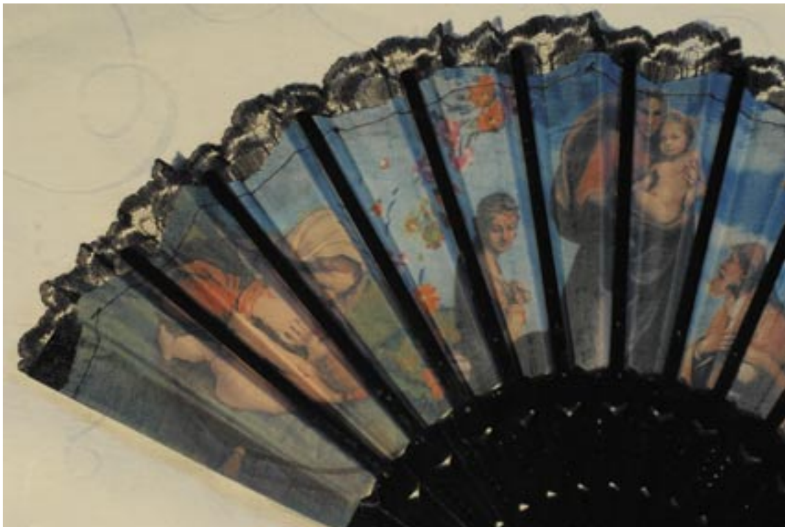
Urban Theatre Project , The Folding Wife 2007.