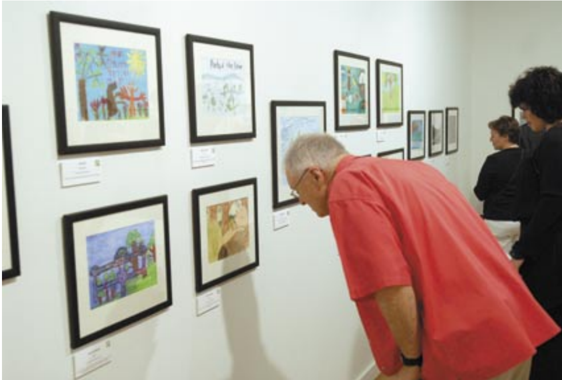
Blacktown Arts Centre Community Open Day , April 2007. Featuring 'Parks of the Future' exhibition, an initiative of the Office of the Minister for Western Sydney.