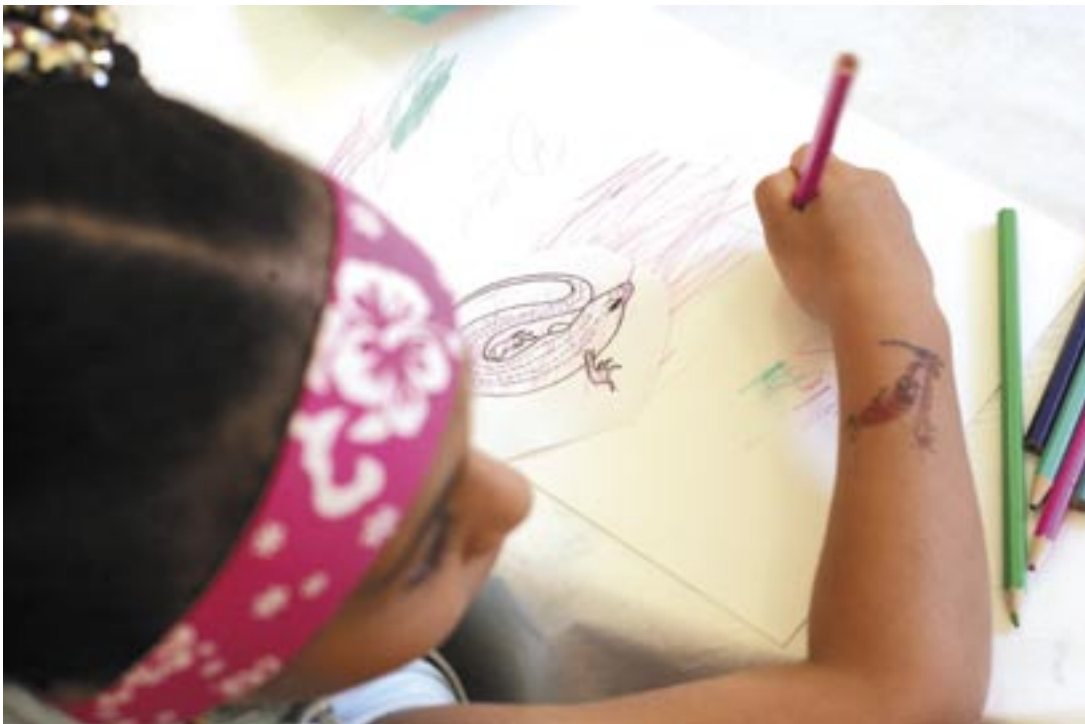
Blacktown Arts Centre Community Open Day, April 2007. Featuring Children's Visual Art workshops.