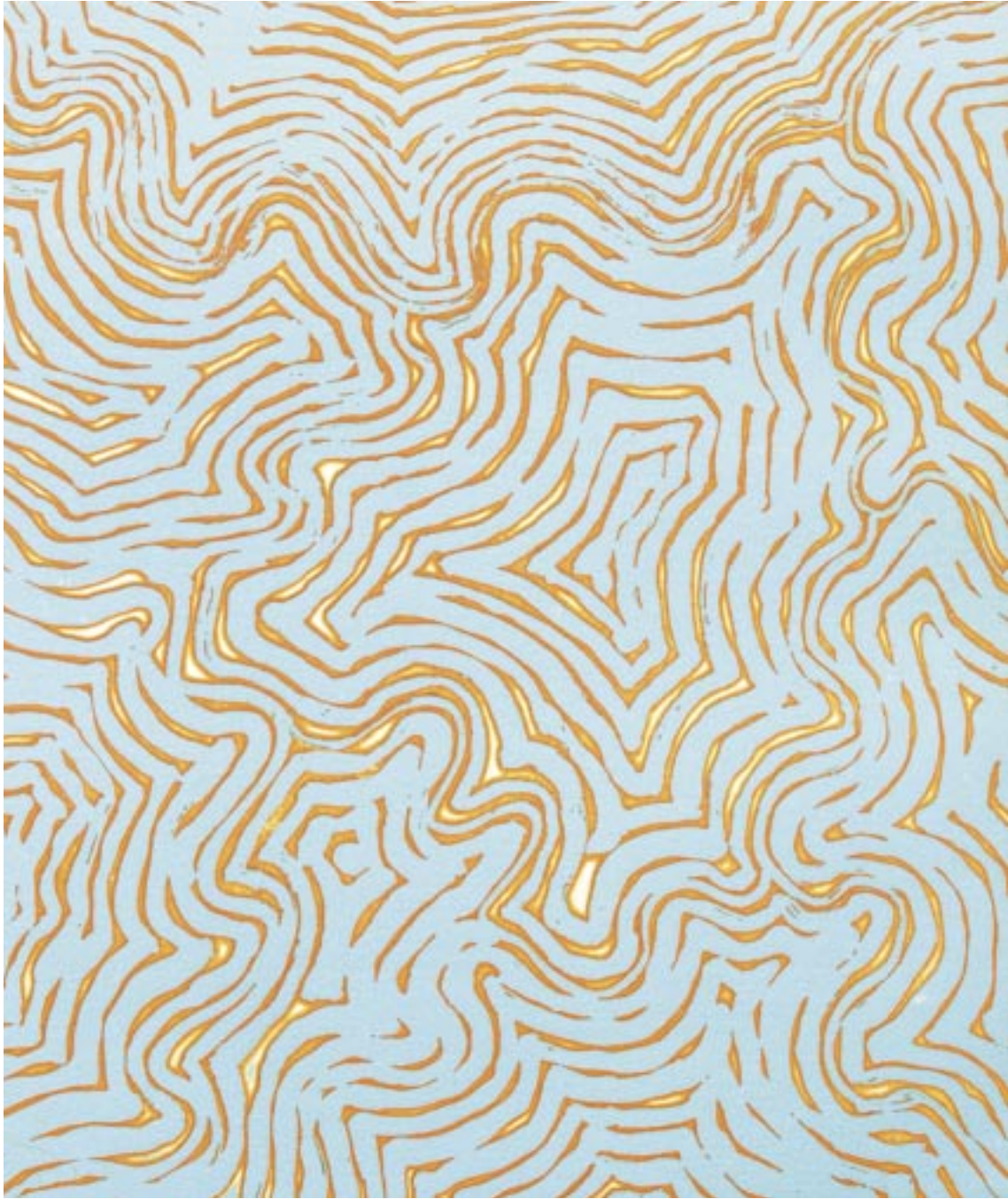
Maylene Marshall , Untitled 2006 , etching Featured in 'Crossing Cultures' exhibition, Blacktown Arts Centre 2007. In conjunction with the College of Fine Arts (UNSW), Corroboree Arts and Crafts Co-op and Papunya Tjupi.