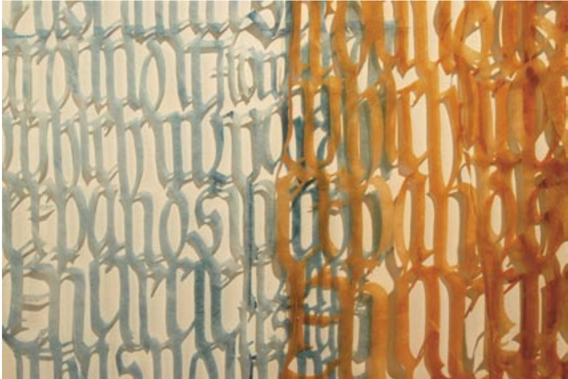
Cathie Cox , Lamina 2007 (detail). Featured in 'Connection' exhibition 2007, Blacktown Arts Centre.